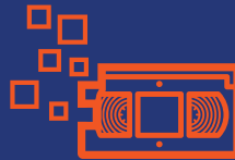
Tape Restoration & Conversion