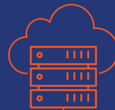
Cloud Storage & Business Continuity