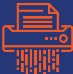
Shredding & Destruction