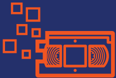
Tape Restoration & Conversion