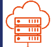
Cloud Storage & Business Continuity