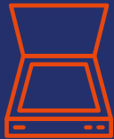
Scanning & Digitisation